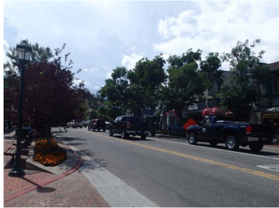
Figures 2 and 3 – Existing Elkhorn Avenue Segment 2: Moraine Avenue (US 36) from Elkhorn Avenue to Craggs Dr./W. Riverside Dr.

Currently two lanes southbound and one lane northbound expanded to include an additional northbound lane from Rockwell Street to Elkhorn Avenue. The existing roadway has curb and gutter and attached sidewalk/streetscape. The Project will reconfigure this segment by restriping to two lanes in a one-way configuration in the southbound direction expanded to include a left turn lane in addition to the two through lanes from Elkhorn Avenue to Rockwell Street.