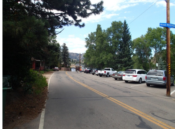
Figures 6 and 7 – Existing Riverside Drive