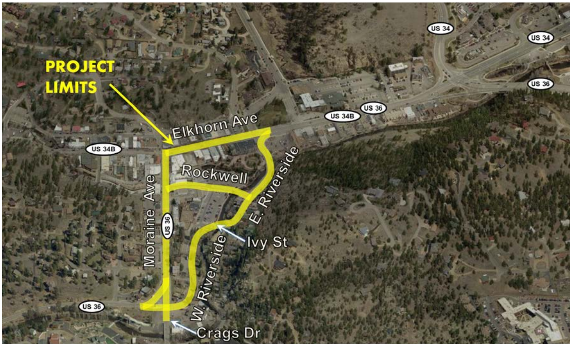
Figure 1 – Project Area Map

Roadway. The West and East Riverside Drive and Ivy Street segments will be reconstructed/realigned using a 25-mph design speed with two 12 foot travel lanes. The application did not include any shoulders but the Town discussed the desire for some sort of on-street bicycle lane, and CDOT standards generally require a minimum 4 foot shoulder. The application shows parallel on street parking on the southern section of the roadway, but no on-street parking on the northern end of Riverside Drive where there are existing driveways, which would lead to backing out onto the US highway.