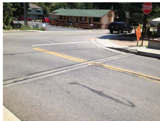
Figure 11 – Ivy Street Bridge Joint

Roadway segments 1 and 2 are classified as urban minor arterial in rolling terrain with a design and posted speed of 25 mph. Roadway Segments 3 and 4 are classified as urban collector in rolling terrain with a design speed of 25 mph.