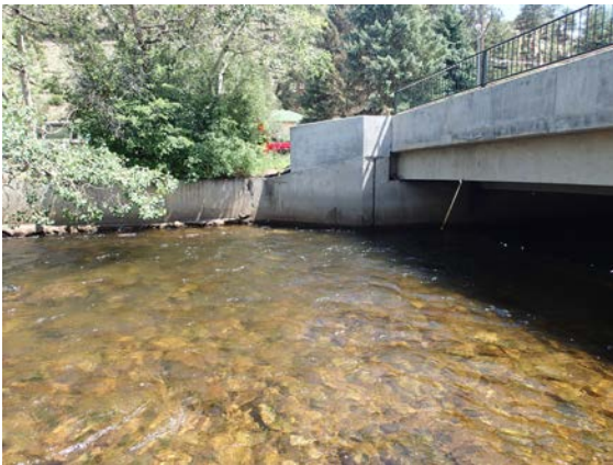
Figure 10 – Existing Ivy Street Bridge

Bridge. The project includes the reconstruction of what was the Ivy Street bridge across the Big Thompson River. This new structure will be on a skew and likely need to be raised to provide the same or better clearance above the river. Only roadway resurfacing, striping, and signing changes are proposed at the Rockwell Street and East Riverside Avenue bridges, as they appear to be wide enough to accommodate the project..