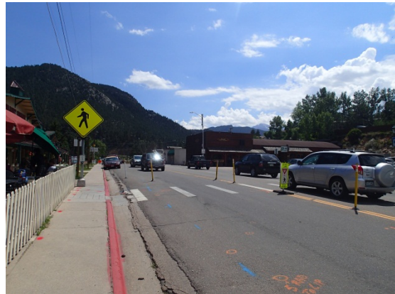
Figures 4 and 5 – Existing Moraine Avenue