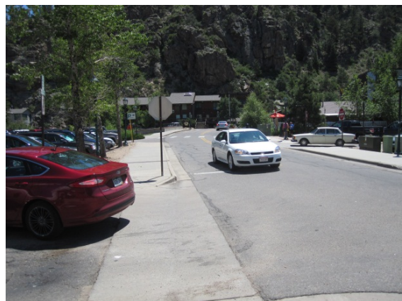
Figures 8 and 9 – Existing Rockwell Street