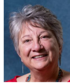
Trustee - 4 Yr