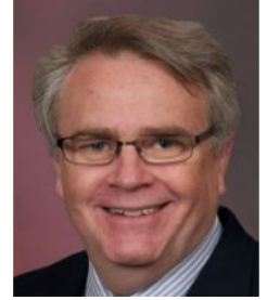
Trustee - 2 Yr