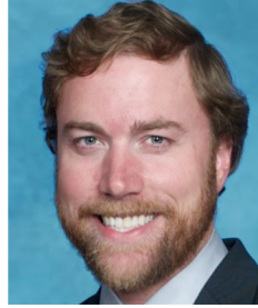
Trustee - 4 Yr