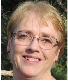
Mayor - 4 Yr