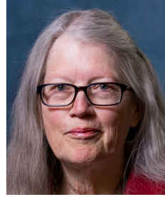
Trustee - 4 Yr